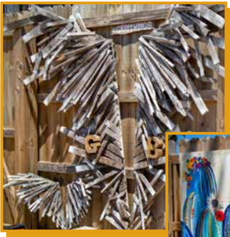
Exhibit on display May 4 - Nov. 1, 2023.

Accepted mediums include, but are not limited to: acrylics on canvas, plywood or metal, wall-mounted 3D works, mosaics, etc. Works on paper are not ideal for this purpose. Outdoor house paints and/or spray paints are ideal, otherwise coating the piece with a generous layer of clear coat outdoor sealant would work best to protect it from the elements.